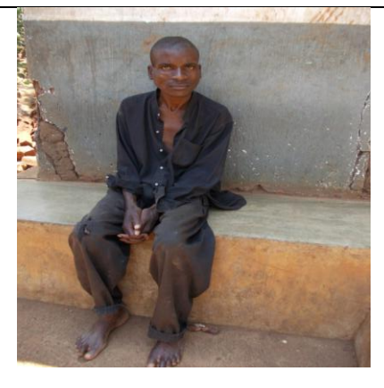
Pius – Born in 1975, HIV positive, wife and daughters ran away due to husband's illness. Home situation very pathetic with no food and poor shelter.